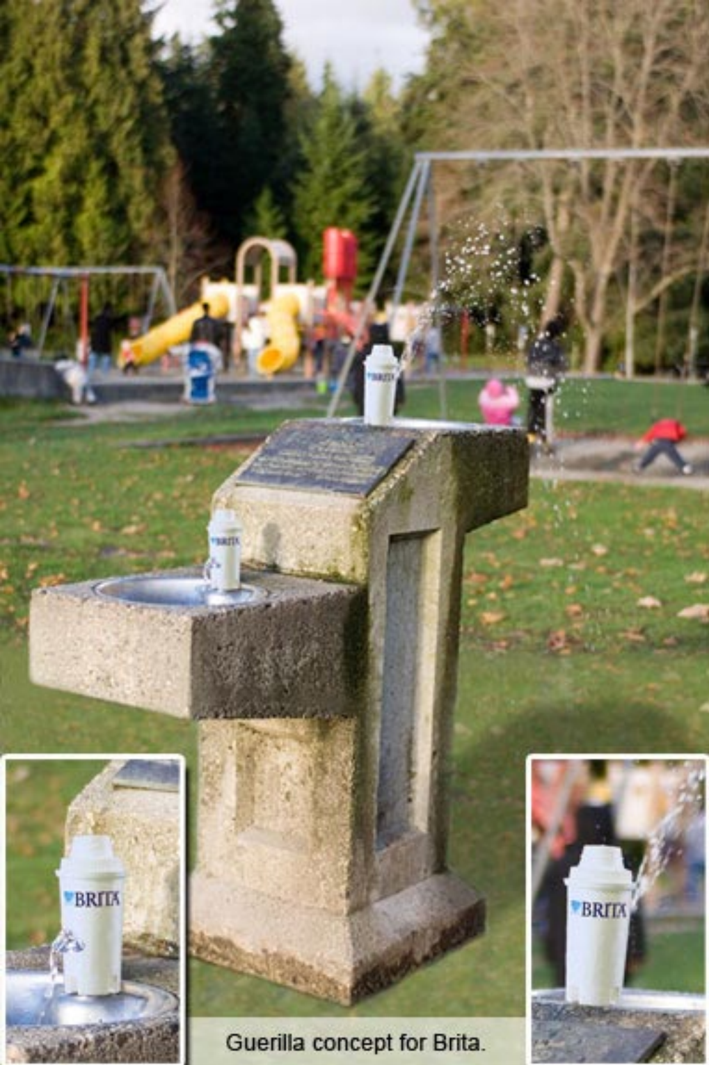
Guerilla concept for Brita.