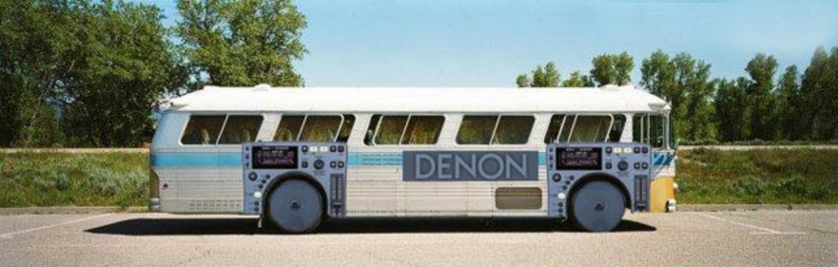
Bus ad for Denon turntables.